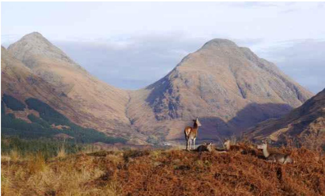
Autumn in Glen Etive