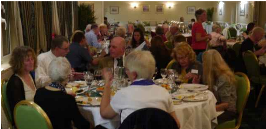
A view of the dining room during the Supper

Eighty eight members and guests sat down to the annual Supper at 7.30. Once again the Ben Nevis Hotel provided an excellent meal and afterwards members took their coffee through to the ballroom for the auction and raffle and then lingered chatting to friends for the rest of the evening.