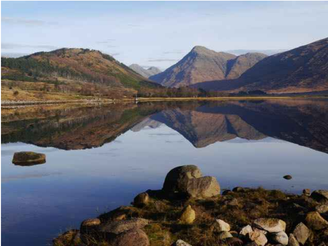
Loch Etive reflections