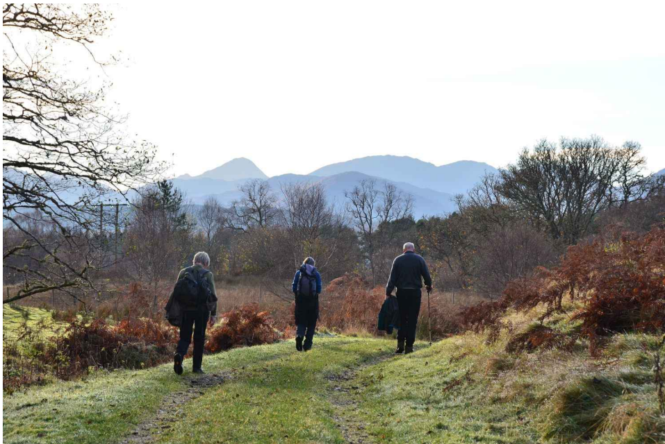
Heading home under clear blue skies.