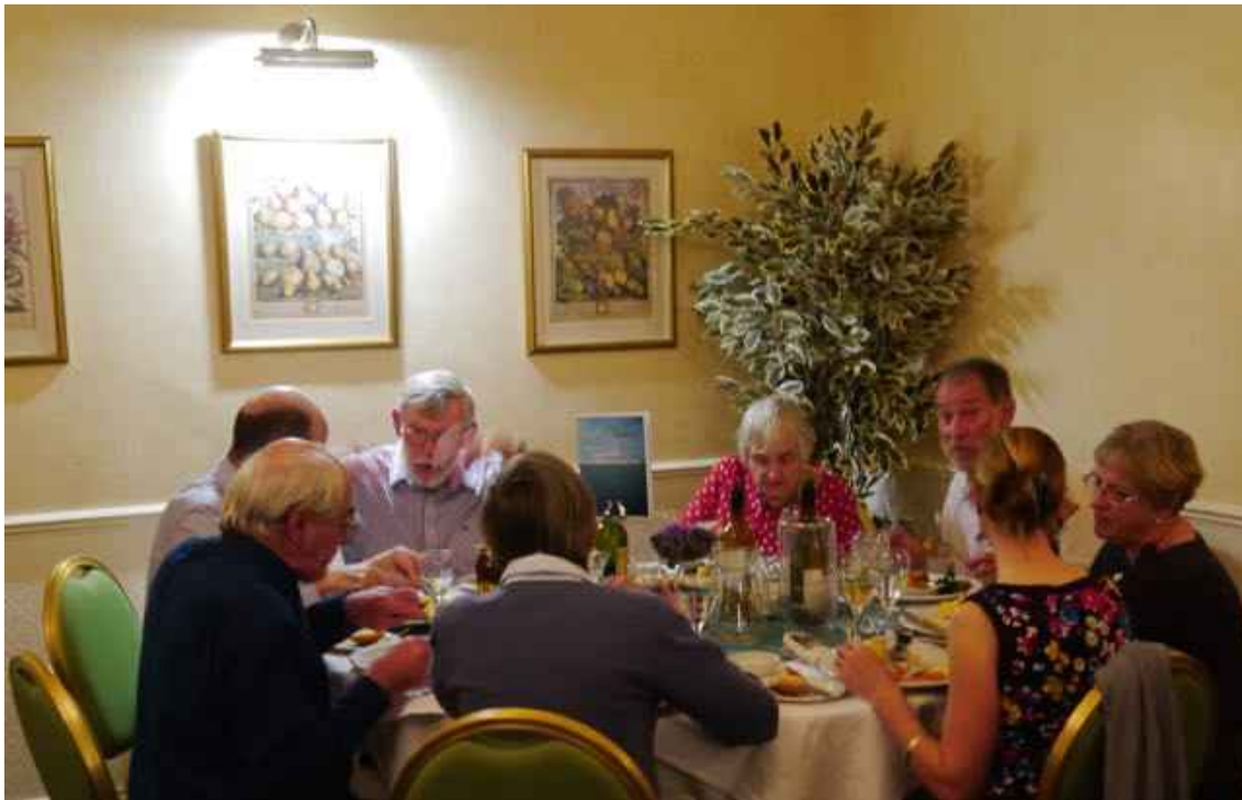
And a third view during the Supper