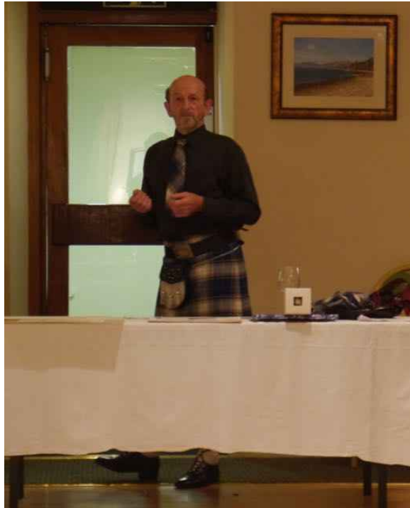
The President, in Arctic tartan, as auctioneer