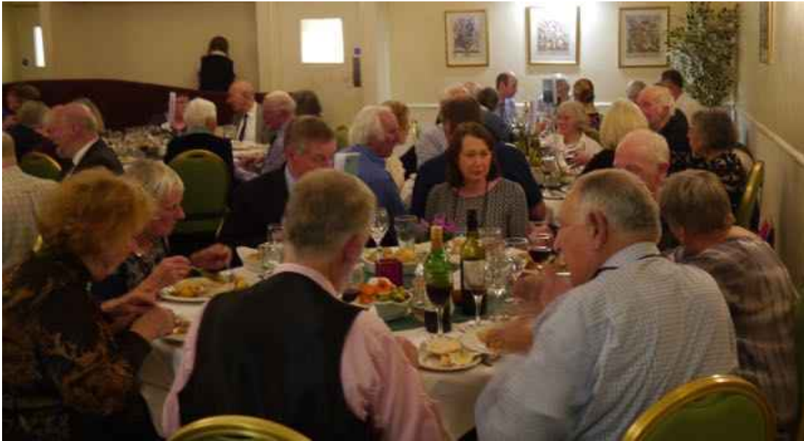
Another view of the diners