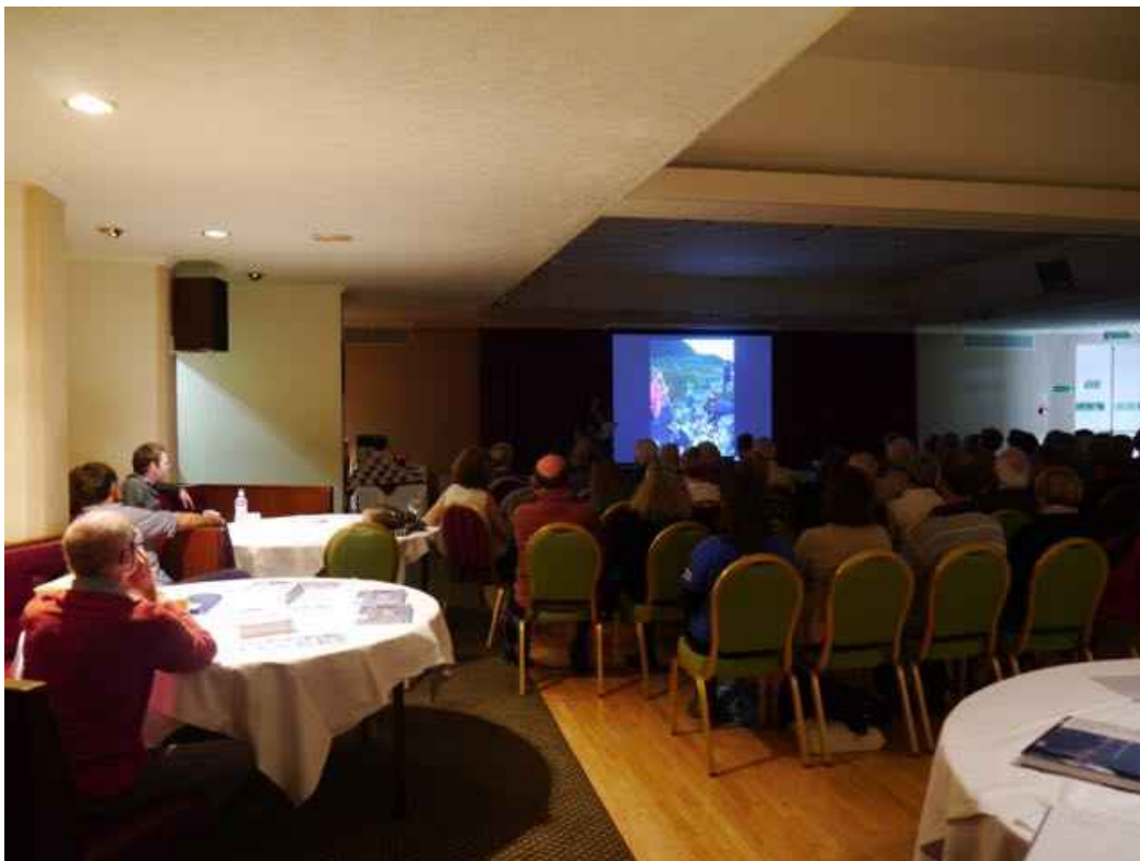
One of the presentations in the ballroom of which we have sole use for the afternoon and evening.