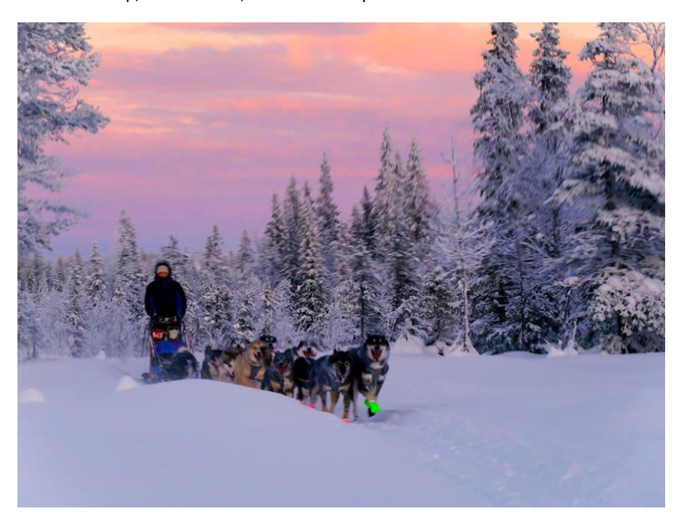
The Pink of Cold

Until the wind kicked up, but the wind, is another story!