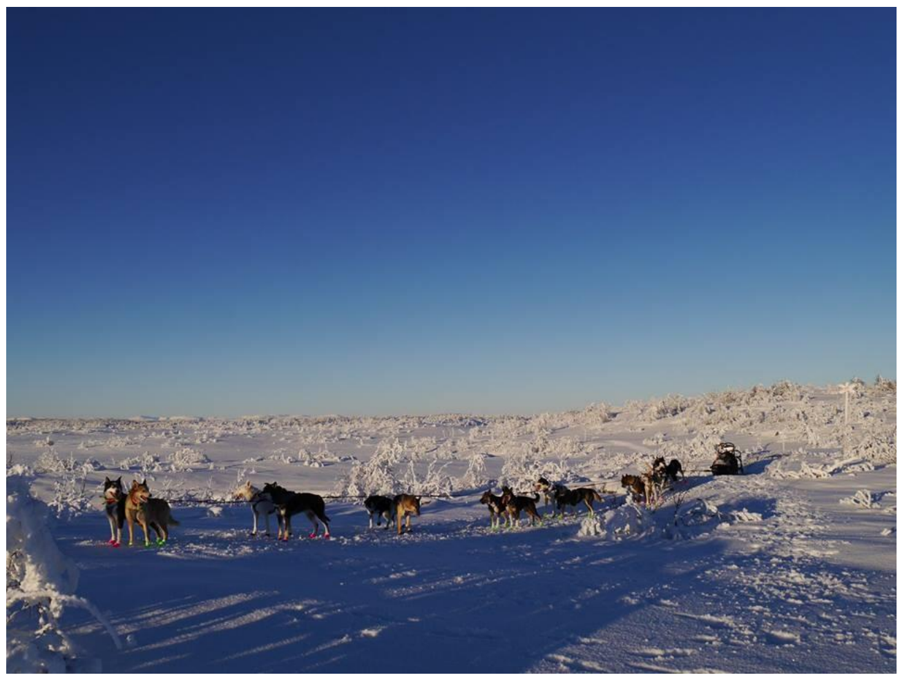
Across the tundra