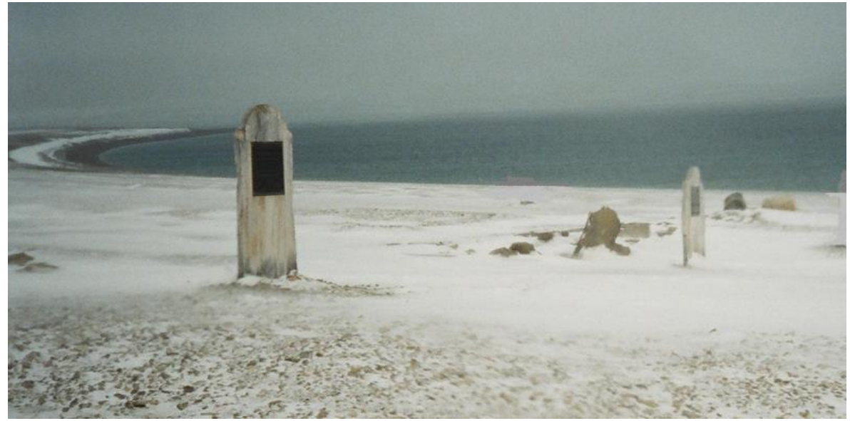
The Franklin Expedition graves on Beechey Island.

With a sigh he turned down the slope and followed his companions back to H.M.S. Erebus. The new grave lay open behind him, cold and silent, awaiting its occupant.