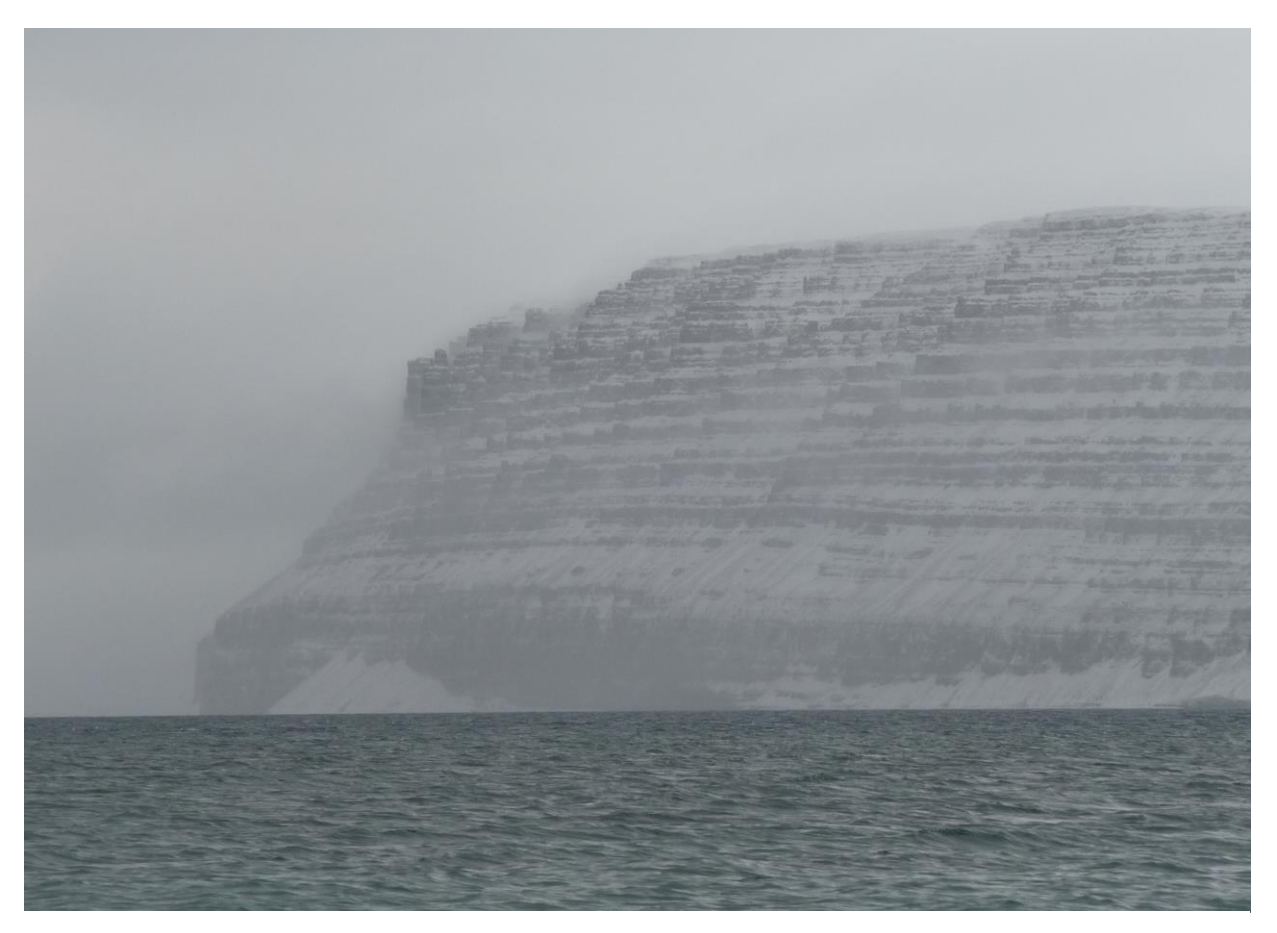
Beechey Island, Lancaster Sound.