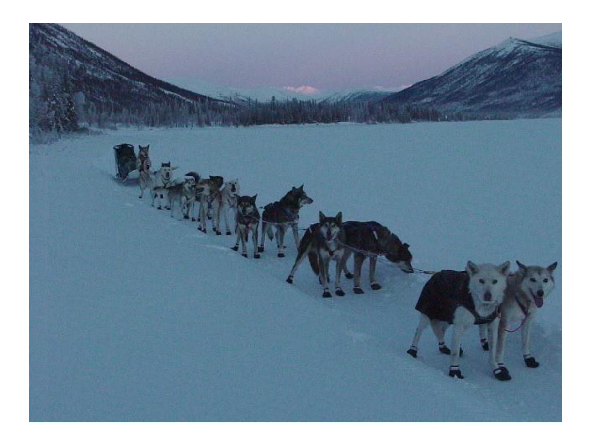
Departing our Brooks Range cabin. This day was -65