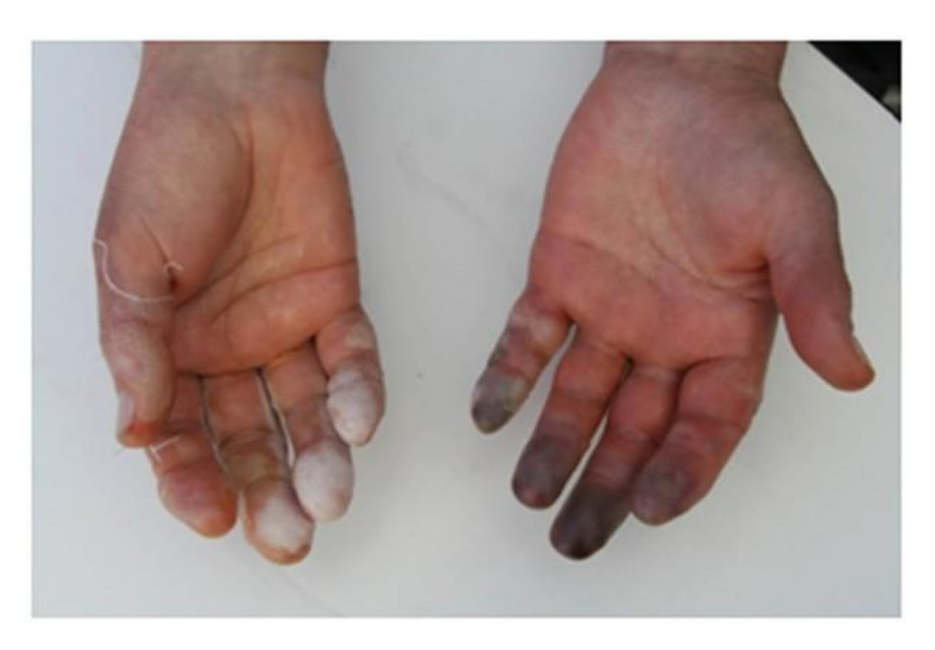
The price to pay for booties!