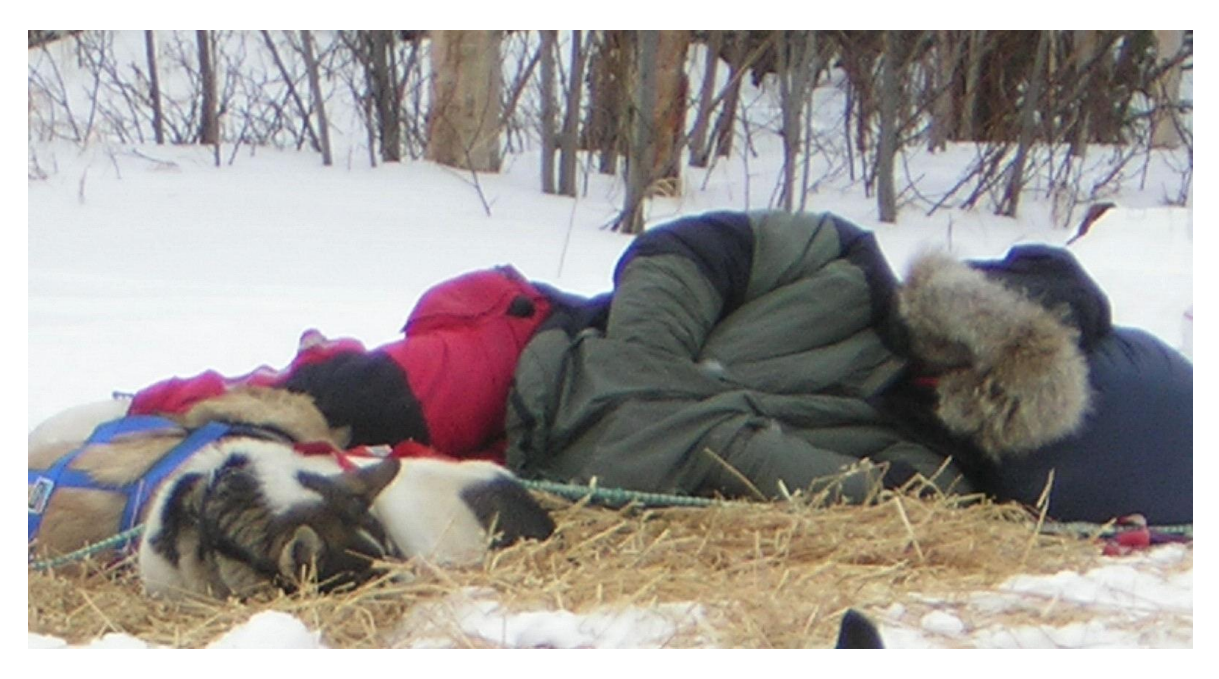
Camping on the trail