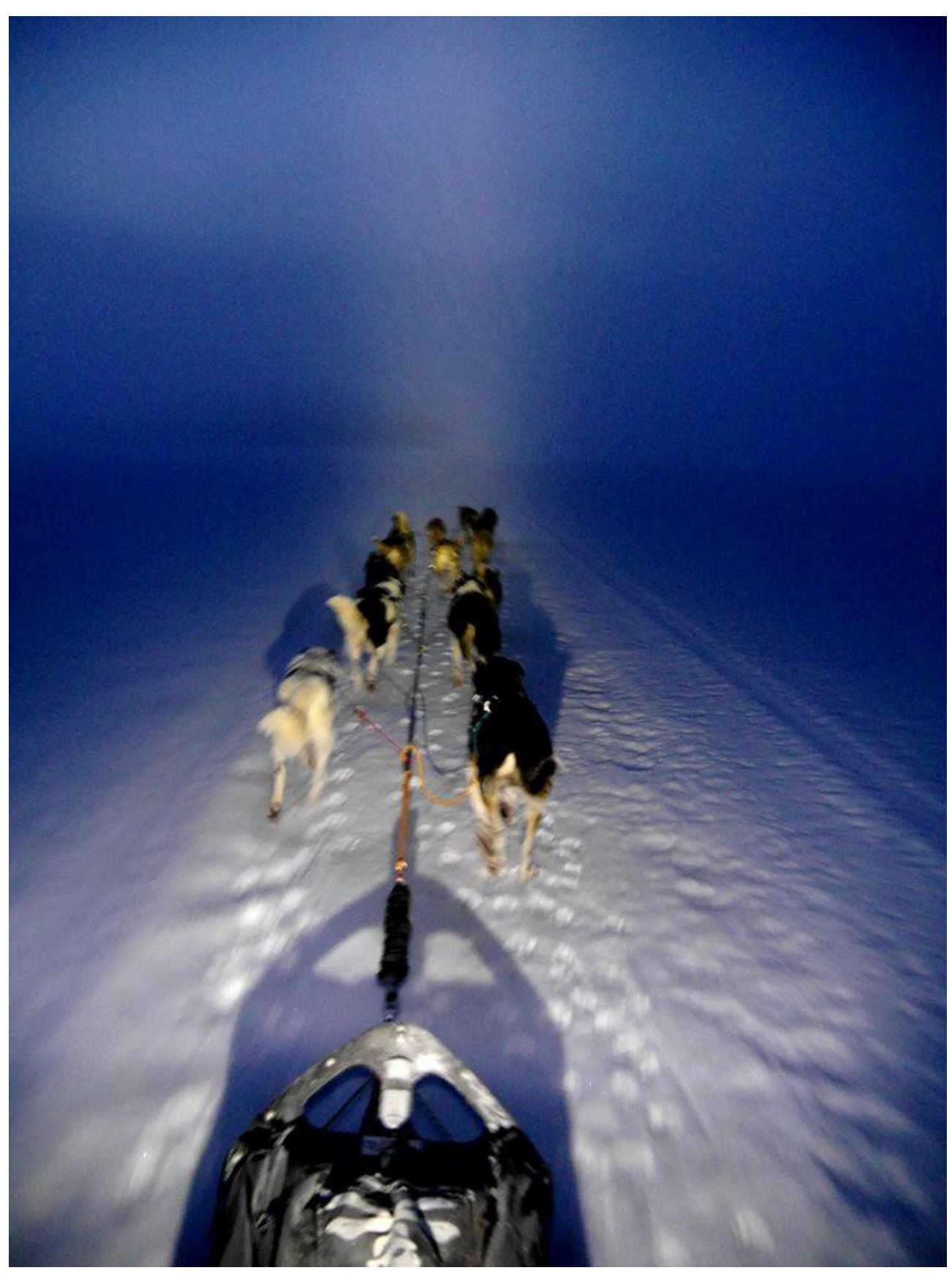
Dead of night